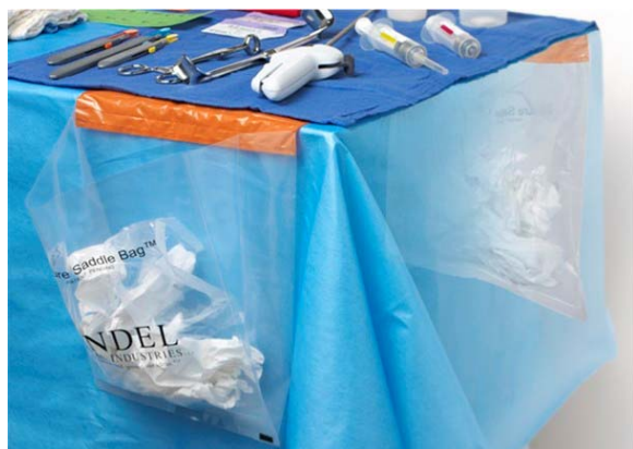
Z Suture Saddle Bag™ on Back Table

Problem: Paper suture bags often rip and fall from the sterile field onto the floor. Contents in bag are not easily visible for identification.