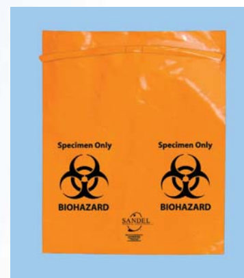
Orange Specimen Bag Reorder #3480