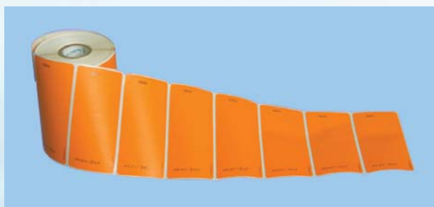
Specimen Labels Reorder #3455