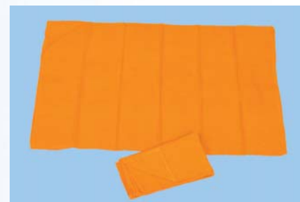
Orange Specimen Wrap Reorder #3460