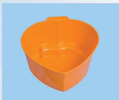
Shaped Specimen Bowl Reorder #3475