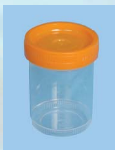
Specimen Cup Reorder# 3470