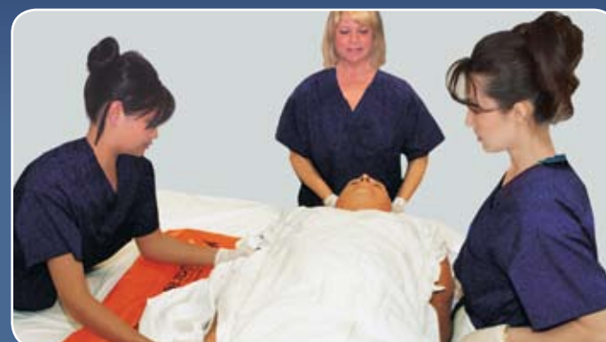
Z-Slider™ Friction Reducing Ergo Device (F.R.E.D.) assists with patient transfer using “no-lift” sliding technique. Eliminate cross contamination. Patent # 6,675,411