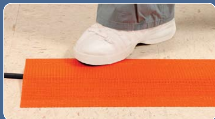
Trip-No-More™ Cord Alert covers cords and tubes on the floor. Bright orange serves as a safety beacon to prevent trips and falls.