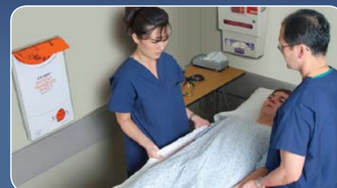
Z-Slider™ Friction Reducing Ergo Device (F.R.E.D.) is used to boost patients. Wall mount dispenser & holder provide point of use convenience.