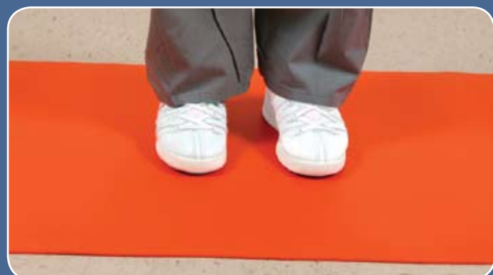
Ergo-Stand EZ™ Anti-Fatigue Mat reduces the stress and strain on joints when standing for long periods.