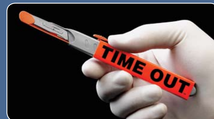
Sandel Weighted Safety Scalpels Protect you and your co-workers from sharps injuries. All Safety Scalpels include a removable TIME OUT Sleeve.